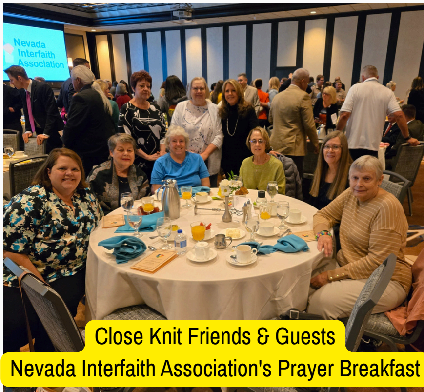
Close Knit Friends & Guests